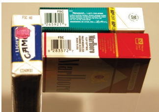
Packs will be labeled with FSC (Fire Standard Compliant).

Combustion of discarded smoking materials is the second leading cause of home fire-related deaths and injuries in the United States. According to the United States Fire Administration, states that have passed fire safe cigarette legislation such as New York have seen a 33 percent reduction in the number of fire-related deaths and injuries caused by discarded smoking materials.