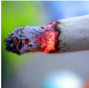
Cigarettes are designed to self-extinguish due to the banding in the wrapper.